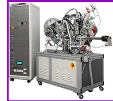
XPS, UPS, cluster beam