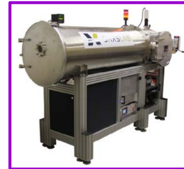
Small-angle X-ray scattering