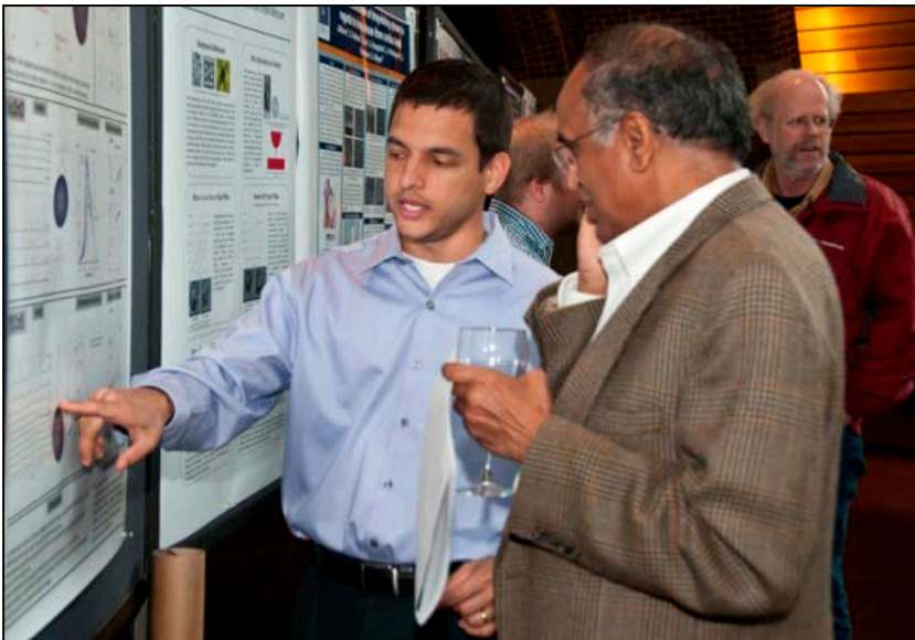
Annual Meeting Poster Session